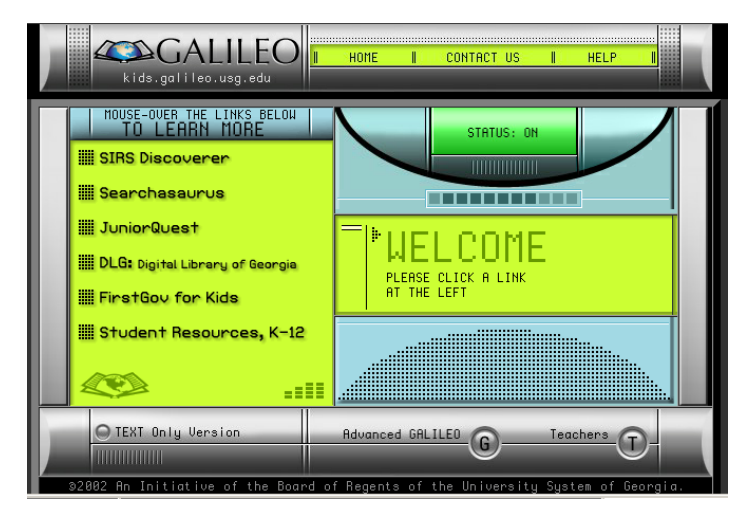
GALILEO's new Kids' Page Interface

http://kids.galileo.usg.edu: The Kids' Page has its own URL, so you can bookmark it on computers in the media center,