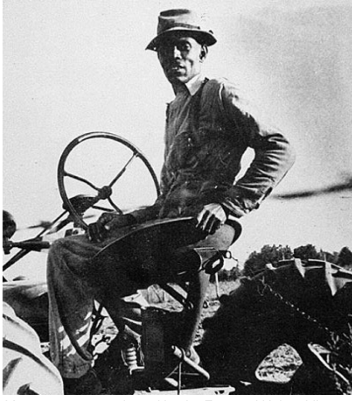
Man on tractor purchased by the Farmers' Union, Liberty County, 1940s (Vanishing Georgia Collection)

Visit the Digital Library of Georgia at http://dlg.galileo. usg.edu.