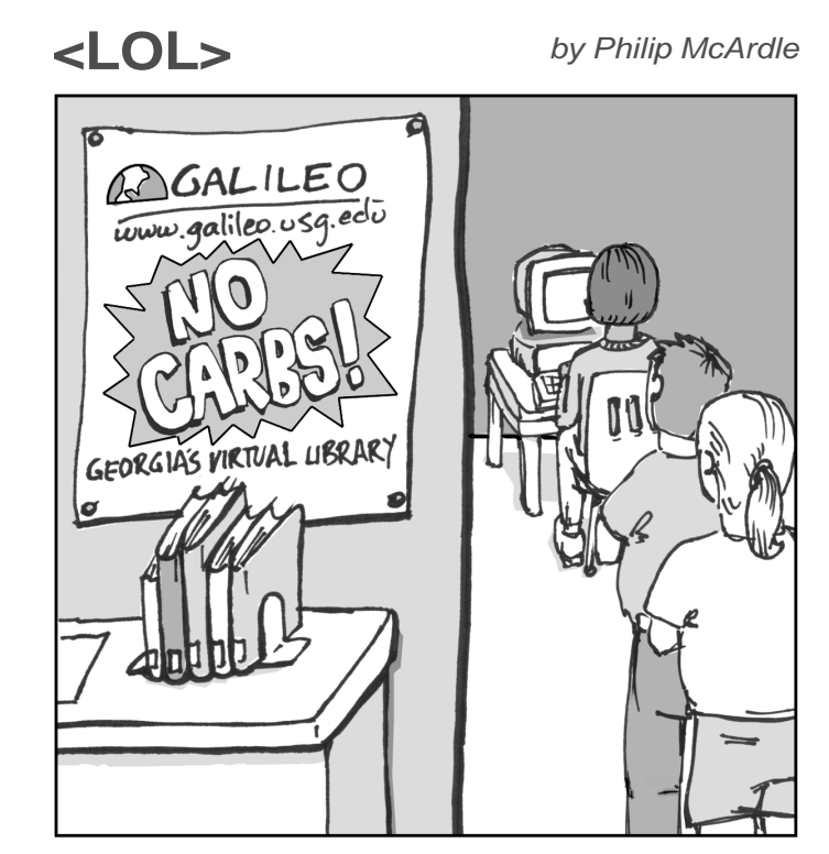
GALILEO's latest marketing strategy.

The members of the project team are continuing to work with