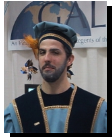
Galileo explores COMO on Halloween.