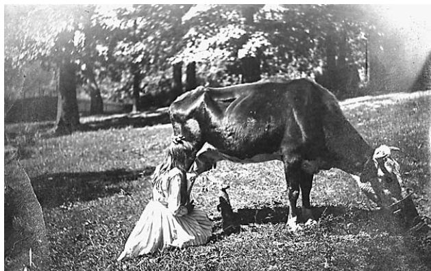
Pet cat reaches for a drink of fresh milk. Cobb County, ca. 1915

Legislative Documents (partners include GALILEO, DLG, Georgia State University, Emory University, SOLINET, and the Georgia Department of Archives and History); the daily diary of President Jimmy Carter (partners include GALILEO, DLG, and the Carter Presidential Library and Museum); the Georgia HomePLACE databases, which include the Vanishing Georgia Collection of photographs, the Georgia Marriage Index Project, and Historical Maps (partners include GALILEO, DLG, Georgia Public Library Service and the Georgia Department of Archives and History); the Georgia Books Project; Baldy Editorial Cartoons; and Arts of the United States. The Institute for Museum and Library Services has provided funding for the Georgia Legislative Documents, and Georgia Public Library Service is providing LSTA funding for the Georgia HomePlace Projects. (continued, page 6)