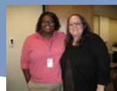
Members of the CRDL Steering Committee