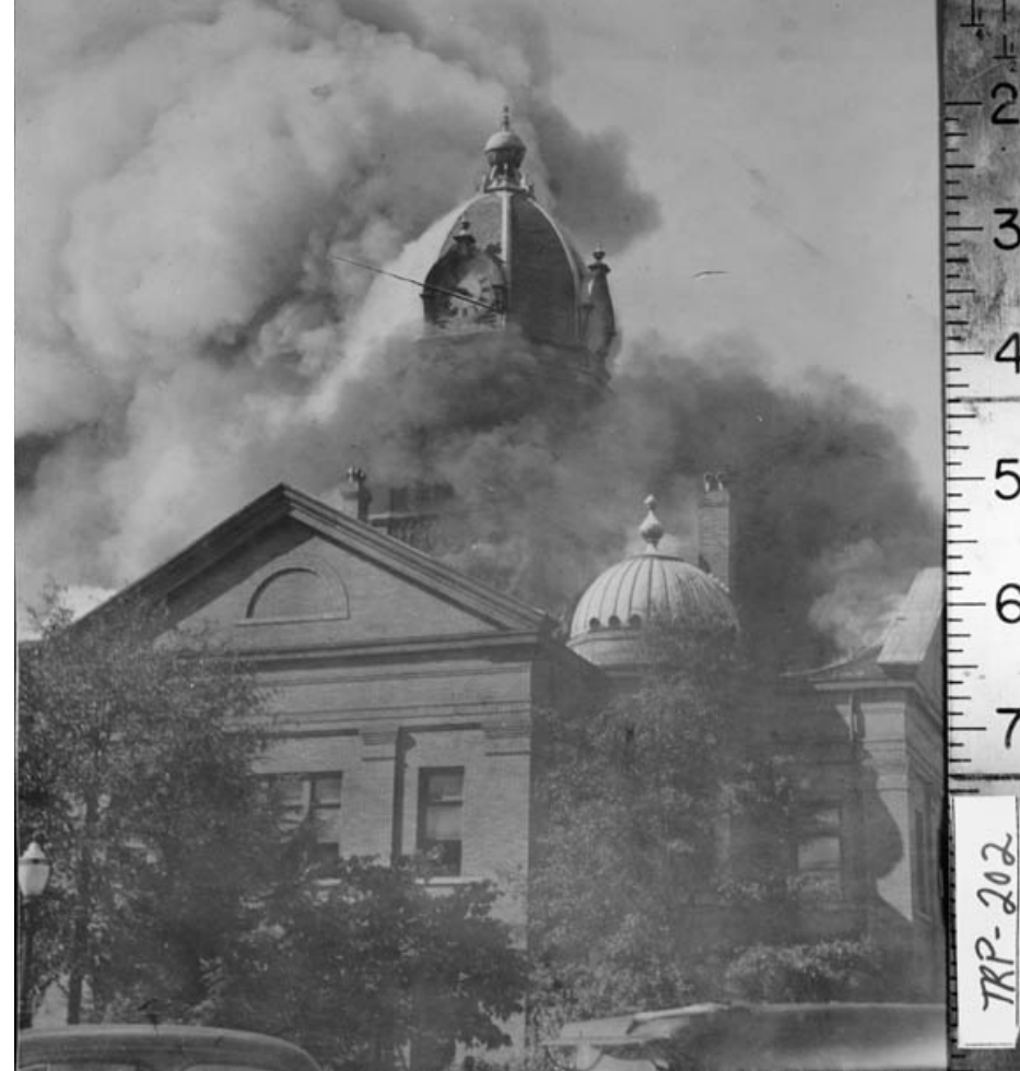
LaGrange, Nov. 5, 1936. Fire which destroyed the Troup County Courthouse.

Was there a record loss event at the courthouse (fire, natural disaster, etc.?)