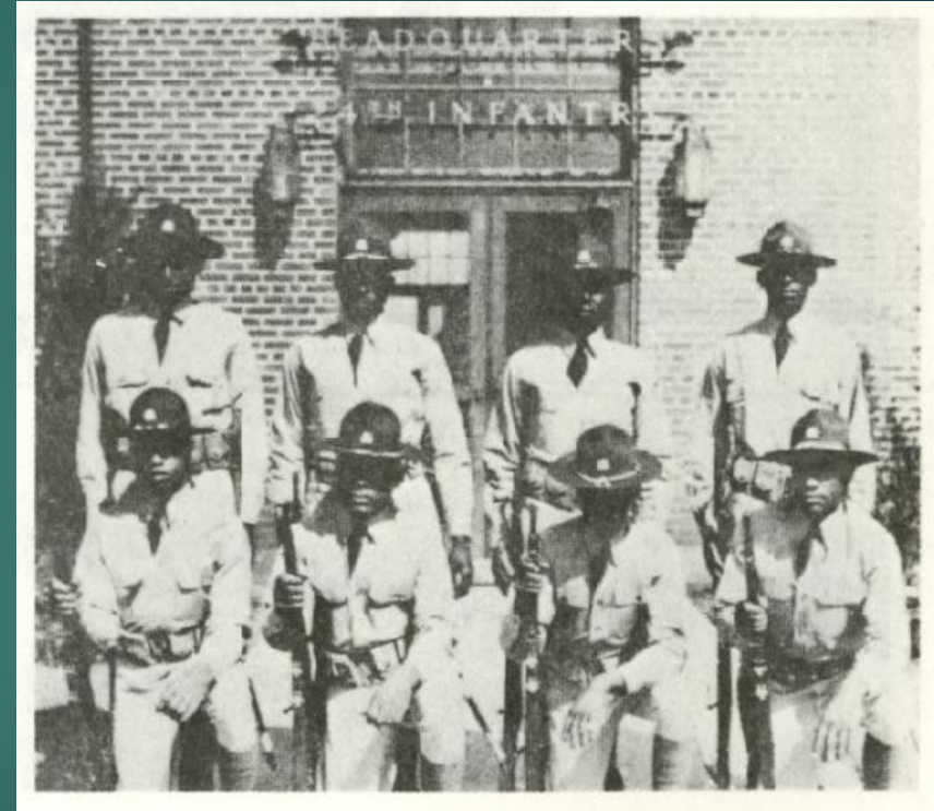
Fort Benning "Home of the Infantry"

Exhibition Item: Eight soldiers of the 24th Infantry pose in front of the 24th Infantry's Headquarters. P. 17