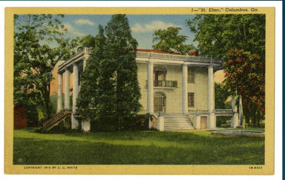
Postcard of "St. Elmo." Columbus, Ga.