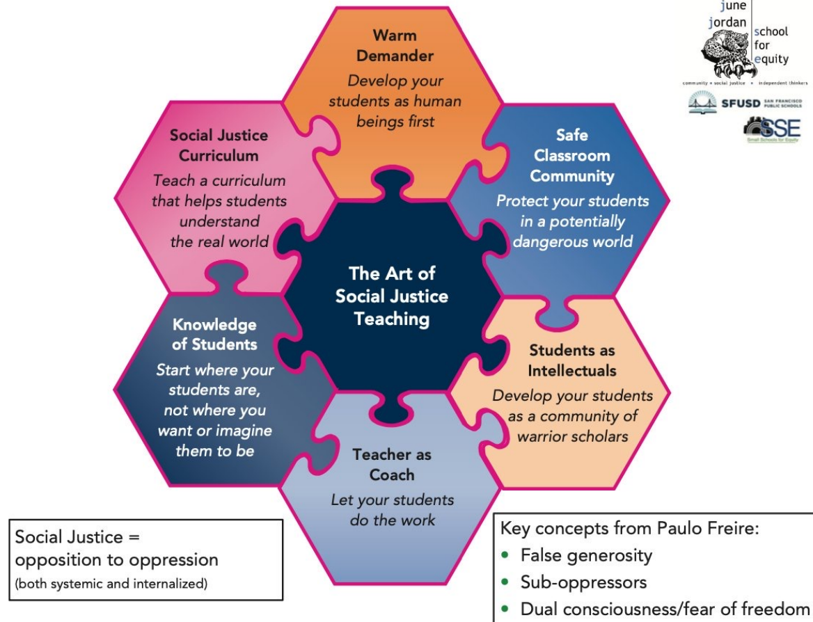
FIGURE 6.4 Six Key Aspects of Social Justice Pedagogy