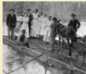
Sanders Ferry crosses the Savannah River to South Carolina. Elbert County, 1910-1919.

The Digital Library of Georgia is being built as a digital repository of primary source material of importance to the history and culture of Georgia, including letters, official documents, diaries, first-hand accounts, maps, photographs, books, and newspapers. Whether average citizens, civil war buffs, genealogists, K-12 students, Georgia legislators, or international researchers, the Digital Library of Georgia is on a mission to make materials unique to Georgia and Georgia history available to all. Many of the materials are from the special collections of GALILEO member institutions and are being collected through collaborative partnerships among state agencies. The Digital Library is just beginning its efforts to capture and present the fragile historical documents which are essential to Georgia, providing a great opportunity for the state to invest in its rich heritage.