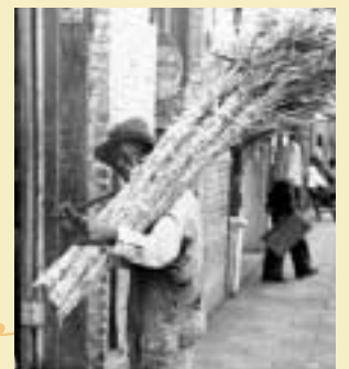
Handmade brooms for sale in Dublin, Georgia. Laurens County, ca. 1890. Vanishing Georgia Collection Georgia Department of Archives and History