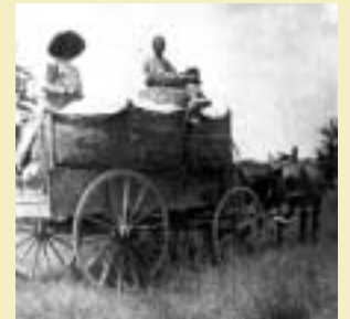
Men on wagon with cotton.