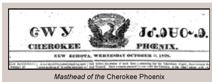
Masthead of the Cherokee Phoenix

For my money, it beats reading about Enron.